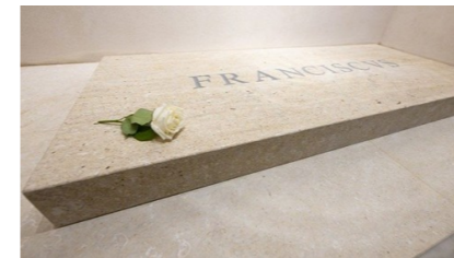
Pope Francis' resting place in Santa Maria Maggiore